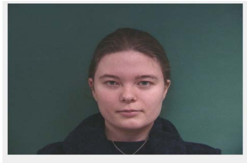
Fig. 2 : RGB image of user

Initially an RGB colour image of the user is captured using a web camera or high resolution video camera. The size of the face image is 640x480. It is represented as an array of m \times n \times 3 color pixels corresponding to the red, green and blue components of an RGB image. Three dimensional RGB is converted into two dimensional binary image based on threshold values. The input face image is transformed into binary face image for retaining the important features. Background changes, illuminations are adjusted and concentrating on the face region alone. This process referred as Preprocessing for improving the quality of the image shown in the figure 2.