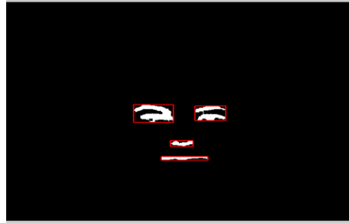
Fig. 3 : Detected Regions with bounding boxes

Feature extraction is performed after preprocessing the input face image. The regions of two eyes, nostrils and mouth are located in the face image and Blob measurement properties are used in estimating the connected components in the face image. Thus the eyes, nostrils and mouth regions are located in the binary image. Then the regions are represented within the bounding boxes and filled the disconnected pixels are shown in the figure 3.