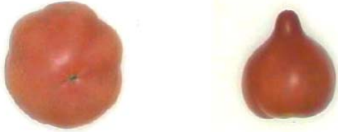
(a) cavernous tomato (b) abnormal tomato (Fig3. Tomatoes with physiological diseases)

It can be seen that, e=1 if round in shape. Since tangential faces of the cavernous fruit are triangular, its roundness is less than 1.