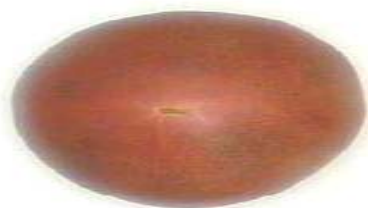
(a) 0° image