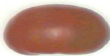
(b) 90° image