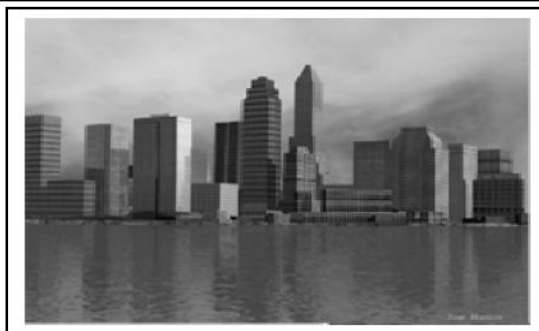
Final output Mosaic Image