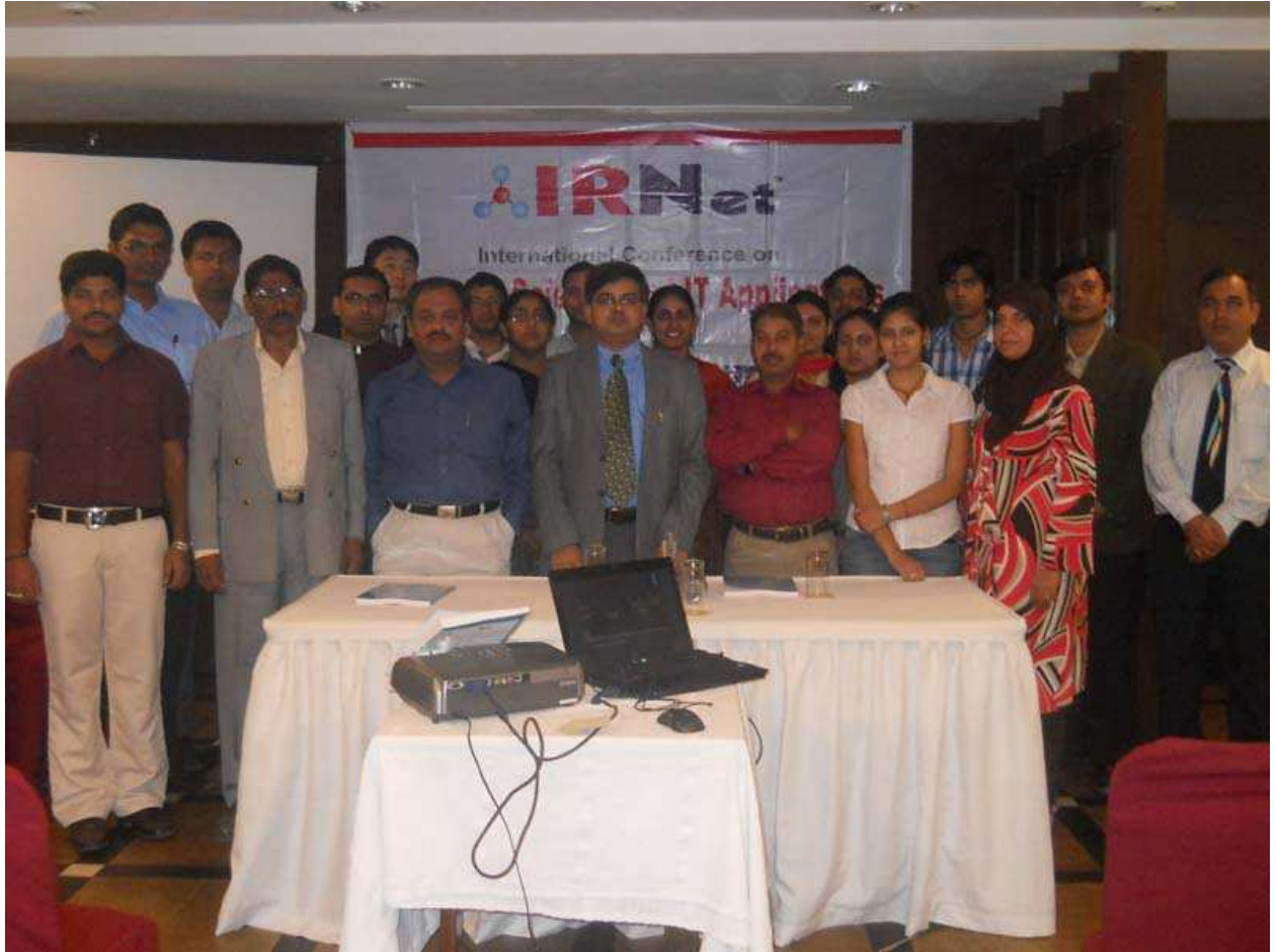
Participants during the CSIT-2011, New Delhi Conference.