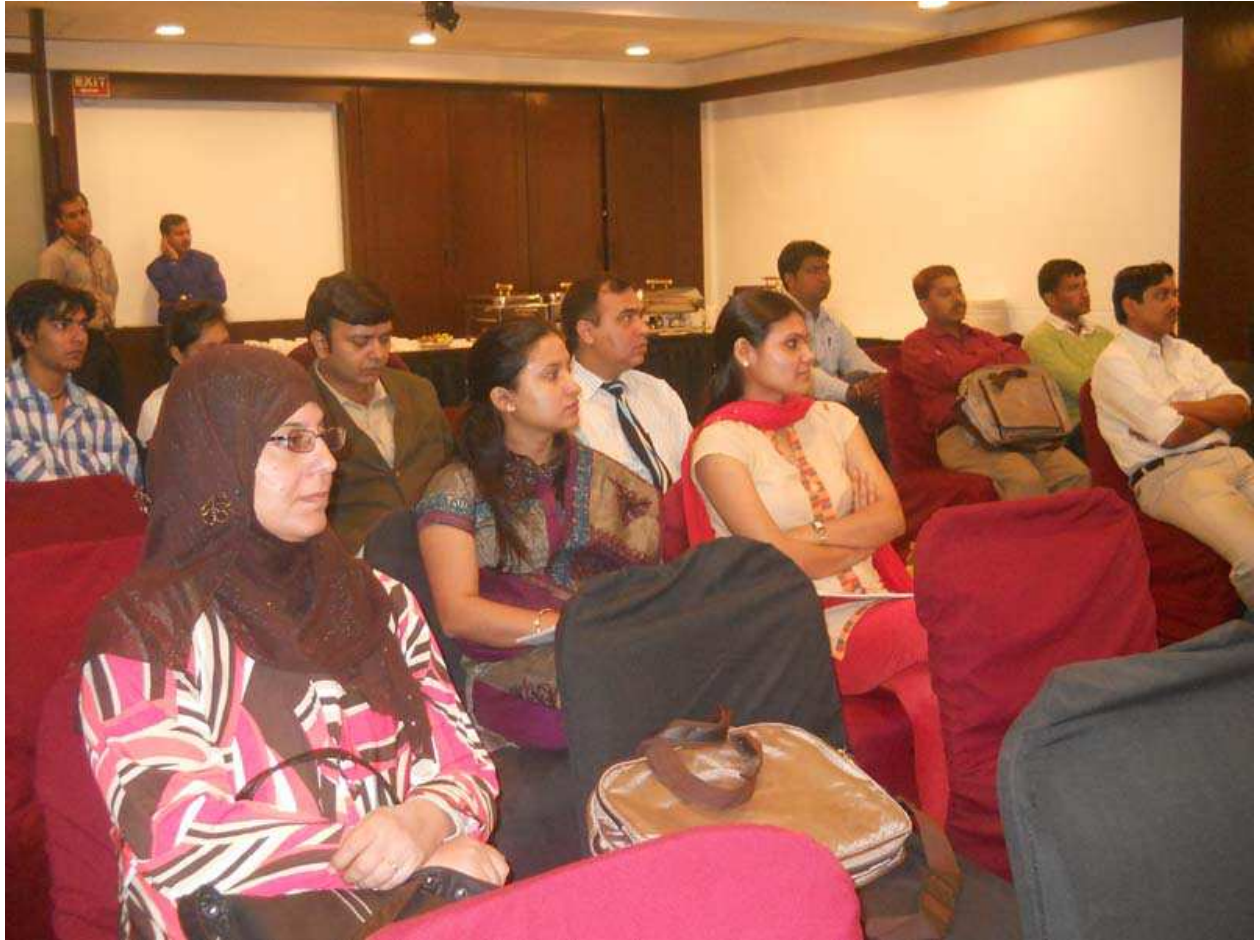
Delegates during the CSIT-2011, New Delhi Conference.